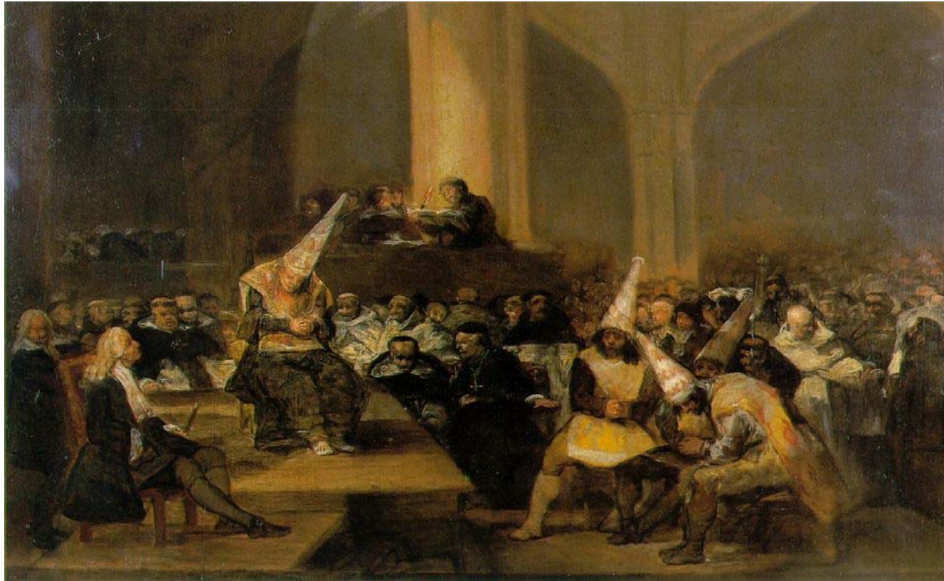
Inquisition Scene, by Francisco Goya, 1816